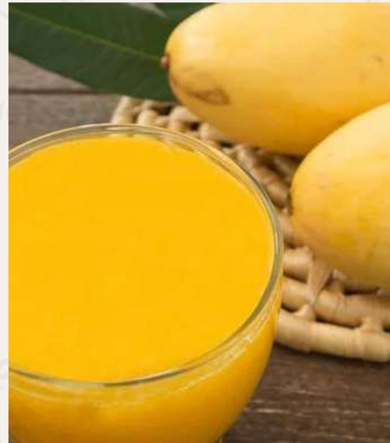
Totapuri Mango Pulp

Concentrated tomato puree, a versatile base for sauces, soups, and stews.