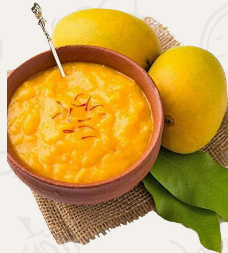
Alphonso Mango Pulp

Smooth and tangy pulp made from Totapuri mangoes, ideal for desserts and beverages.