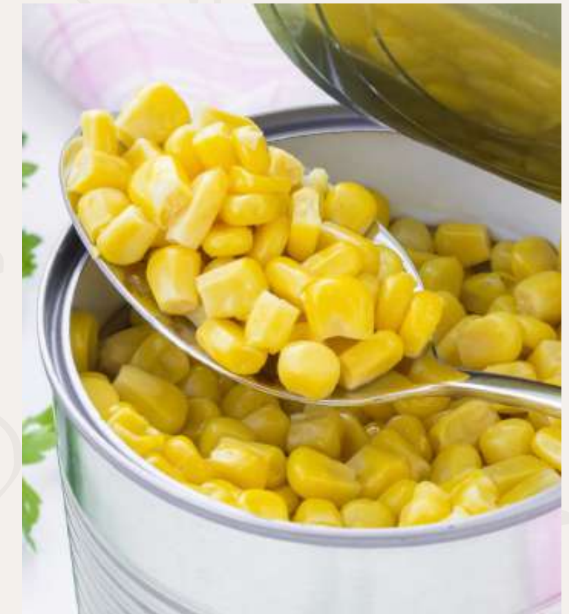
Canned Sweet Corn

Rich and smoky red paprika, canned to enhance dishes with its vibrant color and taste.