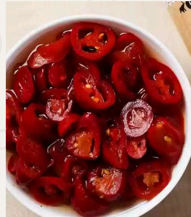
Canned Red Paprika

Spicy jalapeno peppers, canned to add heat and flavor to your favorite recipes.