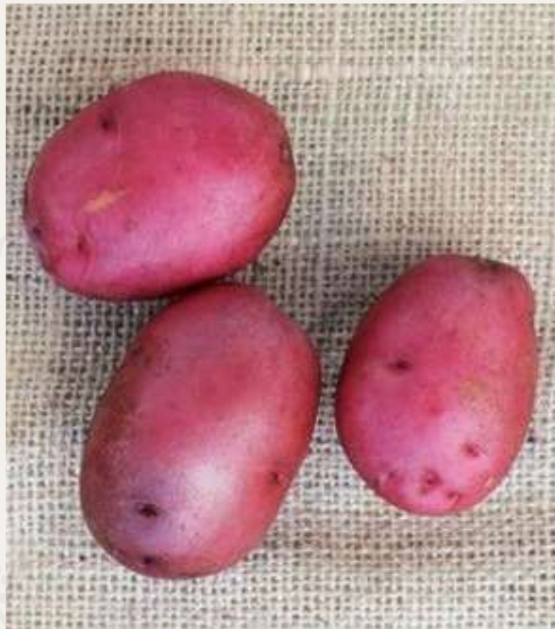
Lady Rosetta (LR)

Lady Rosetta potatoes are favored for making crispy snacks and chips due to their excellent frying properties and flavor.